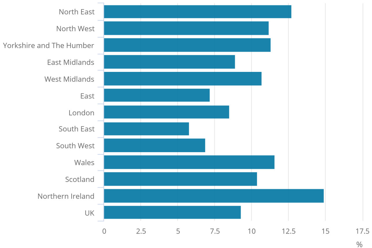
Figure 1: Percentage of children living in long-term workless households by region, UK, 2016

Source: Annual Population Survey (Household)