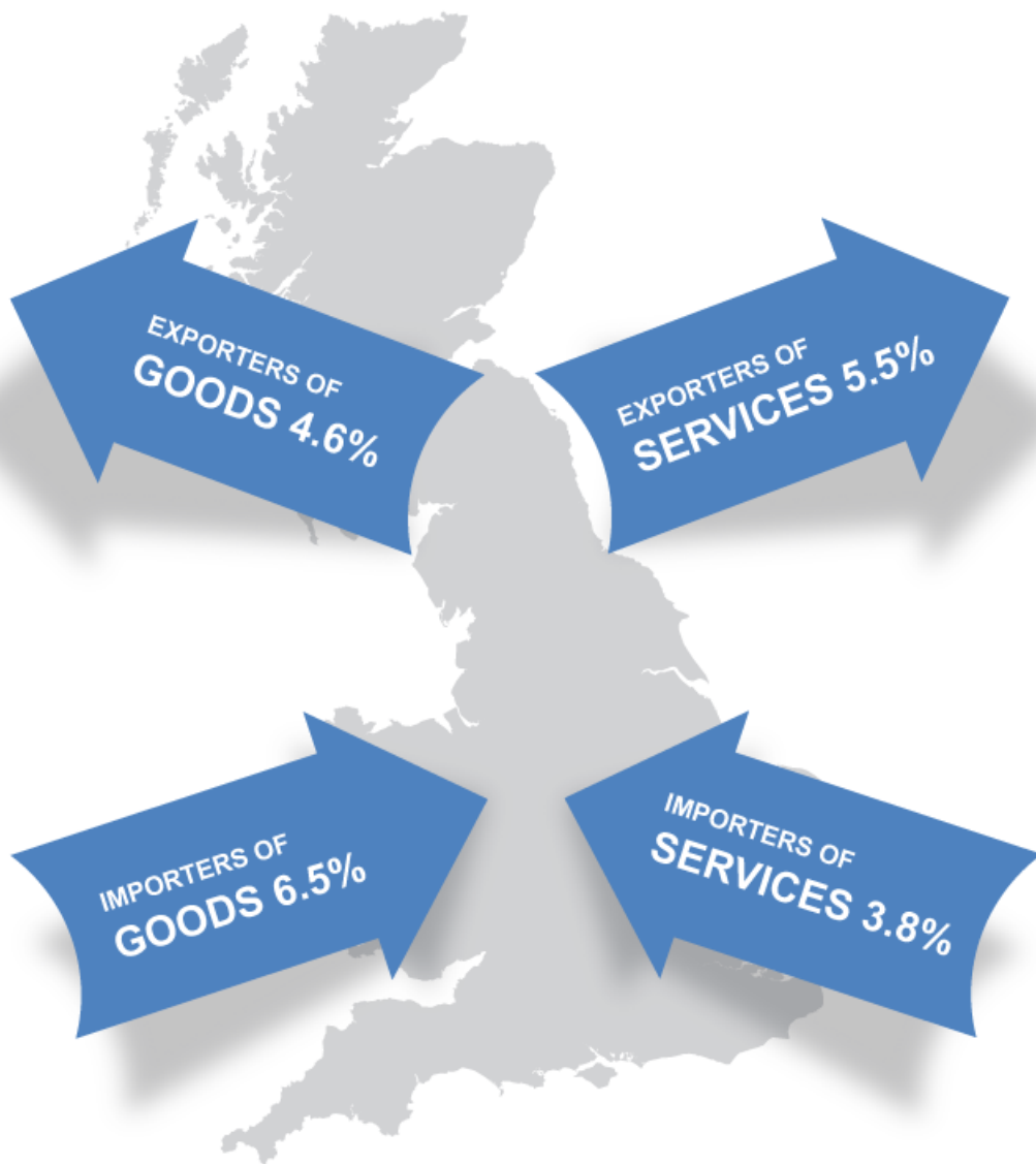
Figure 1: The proportion of businesses that import or export goods and services, 2016, Great Britain

In 2016, there were 4,400 large businesses (those with 250 employees and over) trading internationally. This is over half (52.7%) of the total number of large businesses (8,300) trading in Great Britain. This is a small increase compared with 2015 and 2014, where the number of businesses trading internationally was 4,300 and 4,100 respectively. In comparison, only 12.8% of the total of small- and medium-sized businesses in Great Britain traded internationally in 2016.