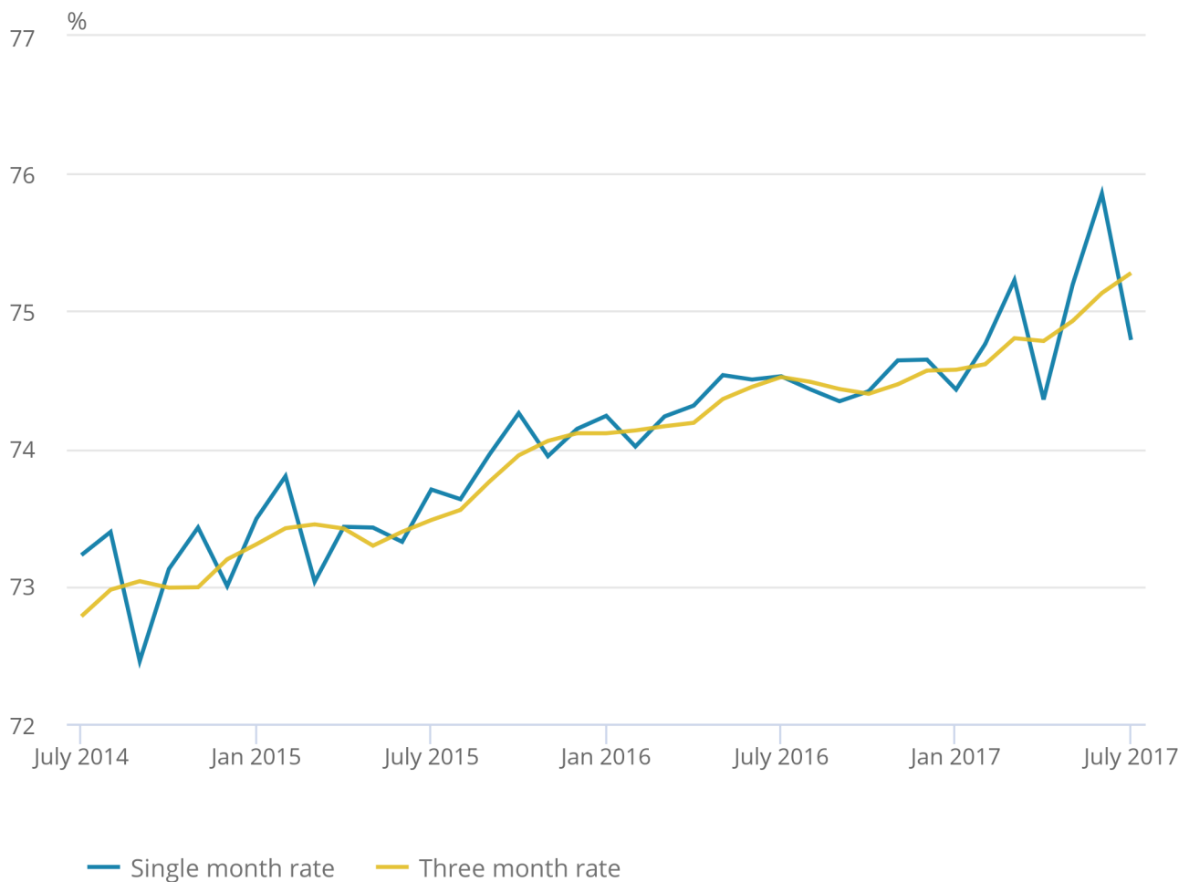
Figure 1: UK employment rates, ages 16 to 64 (seasonally adjusted), July 2014 to July 2017