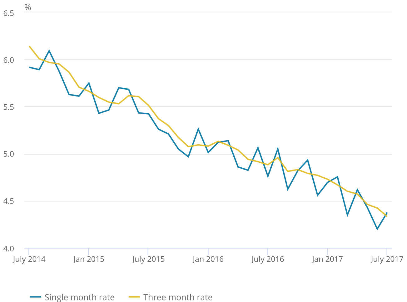
Figure 2: UK unemployment rates (ages 16 and over), (seasonally adjusted), July 2014 to July 2017

Source: Labour Force Survey, Office for National Statistics